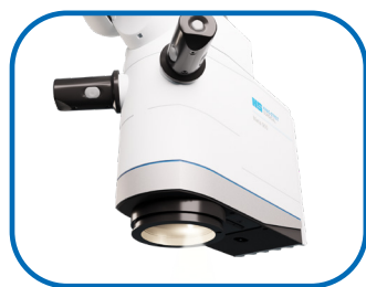
Sustainable LED illumination