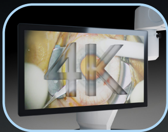
Integrated 4K video