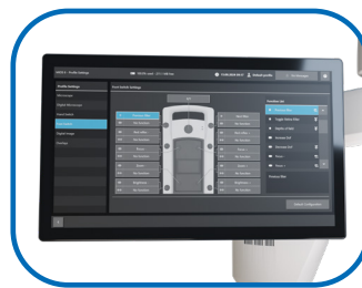
Microscope Imaging & Operating System (MIOS)