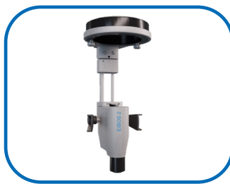
Wide-angle fundus visualization